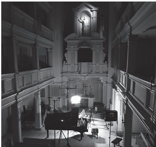
Inside the Jakobskirche